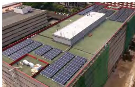
[Central Bank of the Philippines Main Office 200 kW]